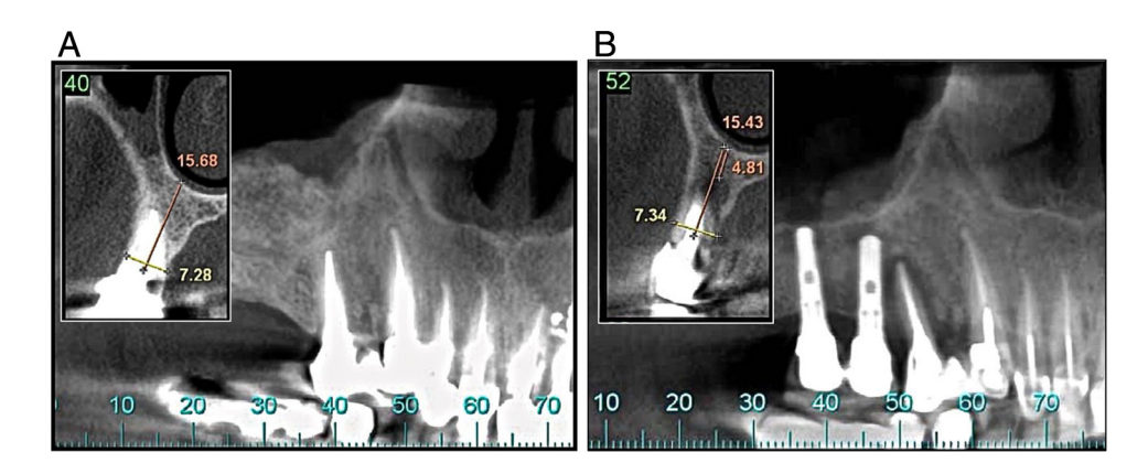
Figure 2. An endodontically treated maxillary premolar diagnosed with VRF after the placement of implants in the adjacent space. ( A ) An endodontically treated maxillary right second premolar tooth at the time of placement of 2 distal implants. There were no clinical or radiographic signs of pathology in the endodontically treated premolar tooth. ( B ) After 10 months, the patient presented with pain and a deep periodontal pocket in the premolar tooth. The tooth was extracted, and the VRF was confirmed.

tooth (10, 11, 17). In the present study, the gold standard selected as acceptable for verification of the VRF (the target condition) was a confirmation after tooth extraction (10). However, after the initial screening of the 41 possibly relevant articles, all articles were excluded because they were not relevant to the topic of this study. Therefore, the current systematic review of the literature revealed that the possible