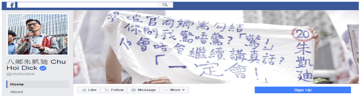
Fig. 1. Screenshot of Chu's Facebook front page with English semantic translation.

main page (Fig. 1), because it provides a sense of the overall theme of Chu's political public relations campaign.