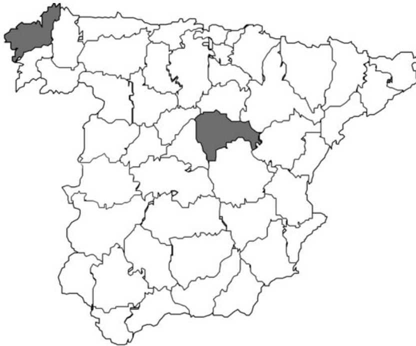
Fig. 1. Location of sampling site areas. Northern apiary sited in Noia (A Coruña, Spain, 42°47'55.8"N, 8°51'55.08"W, Apiary 1) and southern apiary sited in Mirabueno (Guadalajara, Spain, 42°57'8.47"N, 2°43'7.39"W, Apiary 2). The northern apiary (Apiary 1) was composed of 75 colonies of Apis mellifera iberiensis in August 2006 at which point no clinical signs were evident. By the following December (2006), 60 colonies had died with clear symptoms of depopulation in the weeks prior to their death (disappearance of adult bees, unattended brood, reduced colony vigour, no dead or trembling bees around the hives), and the 15 survivors recovered were in heavily weakness (two to three combs with bees and 200–300 brood cells). Samples were sent for analysis in the same month (December 2006), which included 50 dead bees from a collapsed colony, as well as samples of workers bees, brood combs and stored pollen, from the surviving 15 colonies. The southern apiary (Apiary 2) initially contained 150 healthy hives in August 2006 but in December 2006, 50 colonies had died and the rest were not sufficiently crowded to be able to adequately survive the winter (Fig. 2). A total of 10 samples of around 30 bees from each of the dead colonies (CCD colonies) were analysed, as well as 10 samples of worker bees ( n = 100 bees each), brood (around 500 cells surface each sample) and one sample of stored pollen from 10 weakened surviving colonies. After 3, 6 and 9 months of treatments with fumagillin, in the spring, summer and autumn, all the colonies from Apiary 1 and 2 were sampled (foragers honeybee workers) and analysed by PCR for Nosema spp.

proposed as a covert-infecting virus, needing a strong trigger, such as immunosuppression by Varroa destructor (Yue et al. , 2007). The absence of mites in all samples clearly indicates a very low number or even the total absence due to Varroa control. No other viruses were detected, not even Israeli acute paralysis virus (IAPV). This virus was previously proposed as a CCD marker (Cox-Foster et al. , 2007); however, its prevalence is very low (around 15%, data no show) and it has not been associated with colony collapse in Europe (Blanchard et al. , 2008; Higes et al. , 2008a).