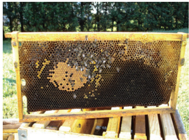
Fig. 2. Weakened honeybee colony with an evident disappearance of most of adult bees, lack of attention to the brood, reduced colony vigour, without any apparent pathological or toxicological problem (no crawling bees, no death bees or dysentery evidenced by the presence of faecal spots in the hive).

The residue analysis of 40 compounds demonstrated that the bees from both apiaries were not exposed to any agricultural pesticides. The only micropollutants detected in the stored pollen were those applied as acaricides by