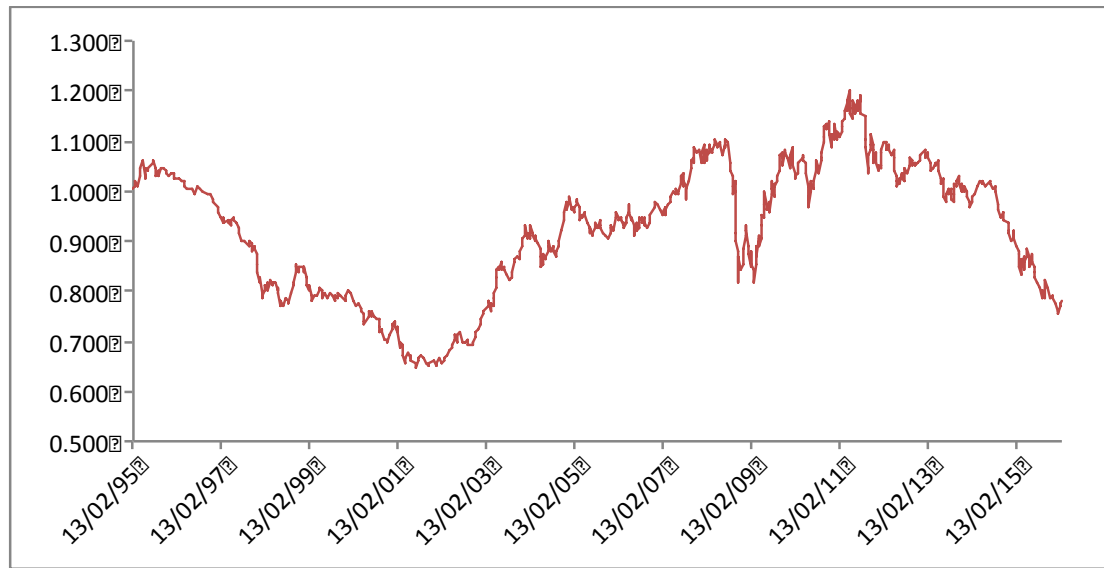
Figure 3: Ratio of the USD Price of Gold to the Nominal Gold Price Index

Notes: The figure plots the ratio of the USD price of gold to the nominal gold price index estimated using the principal components model given by Equations (13) and (14). Both series are based to 100 on 13 February 1995.