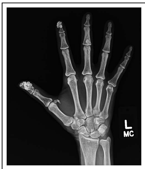
FIGURE 2. 'Wet cotton-wool appearance' of calcinosis on radiography of the hands. Reproduced with permission from [23].

difference in calcinosis detection when compared to radiography [26]. A recent study of 10 SSc patients proposed the use of Power Doppler to detect inflammation around calcium deposits, thus identifying lesions that may be targeted with anti-inflammatory medications [27]. In addition, an ultrasound