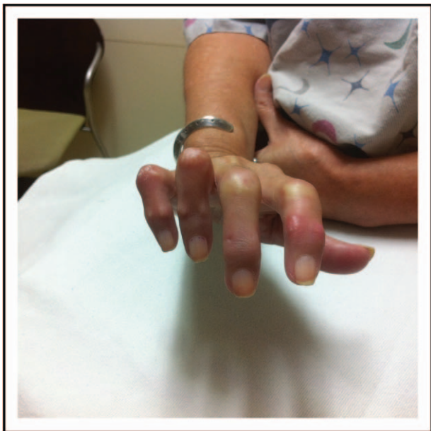
FIGURE 1. Calcinosis of the hand, overlying contracted joints that have frequently been traumatized.

Recent studies have shown different clinical associations with calcinosis based on the population studied. In a single-center study of 215 SSc patients in the United States, calcinosis was associated with limited cutaneous SSc (lcSSc) [17 *** ]. In Mexican and Malaysian cohorts, calcinosis was associated with diffuse cutaneous SSc (dcSSc) [7 *** ,18]. Antinucleolar and anti-Scl-70 antibodies were more prevalent and ACA was less prevalent in Mexican patients with calcinosis [7 *** ]. Similarly, dcSSc and antitopoisomerase (Scl-70)