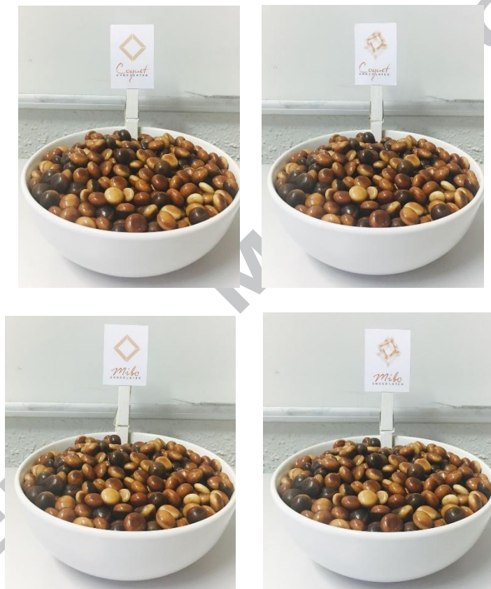
Fig. 3. The four logo conditions used in study 2 as they were presented to the participants.

M_{\text{simple logo-low prestige}} = 16.7 , SD = 15.5 , M_{\text{complex logo-low prestige}} = 12.09 , SD = 9.2 , ( F(1,145) = 2.81 , p = .096 ). For a high prestige product we find a marginally significant effect in the opposite direction: Participants eat more of the product when it features a complex as opposed to a simple logo: M_{\text{simple logo-high prestige}} = 15.9 , SD = 14.2 , M_{\text{complex logo-high prestige}} = 22.2 , SD = 15.4 ; F(1,145) = 3.82 , p = .053 . The effect of logo simplicity seems thus to depend on the perceived prestige of the product featuring the logo.