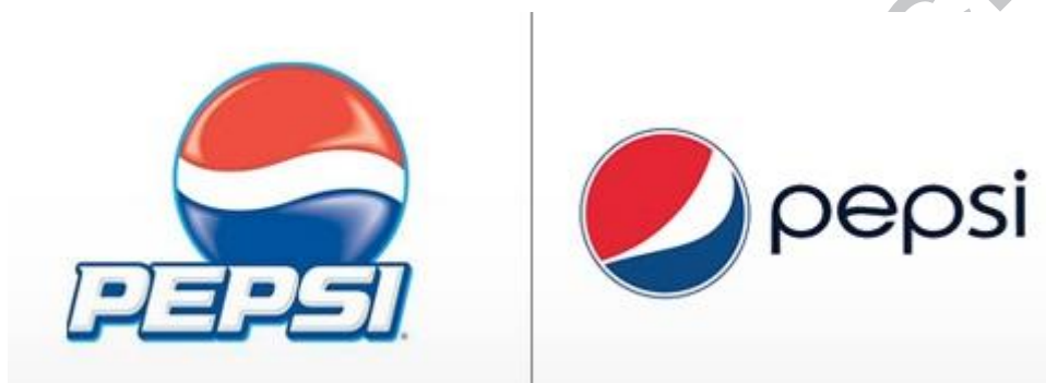
Fig. 1. On the left is the old Pepsi logo. On the right is the redesigned, more simple logo as introduced in 2008.

positive evaluations (Reber, Schwarz, & Winkielman, 2004; Schwarz, 2004; Winkielman, Schwarz, Fazendeiro, & Reber, 2003; Zajonc, 1968). Logos, just like any other stimuli, can contribute to a feeling of overall processing fluency which signals the “[...] subjective experience of ease with which people process information [...]” (Alter and Oppenheimer, 2009, p. 219). As such, products featuring flat design are expected to positively influence the attitudes of consumers.