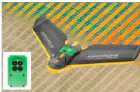
Fig. 4. Sensor for agricultural drone.

Drones are logically well suited for agricultural surfaces as shown in Fig. 4. below, their usefulness depending on the functionality of the sensors used. Offered by one of the leaders in agricultural drones, Agro-sensor is a multispectral sensor for crop mapping. It can be installed on several types of UAVs.