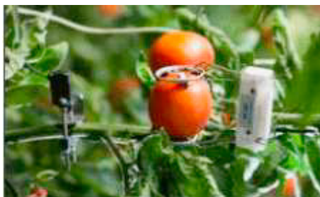
Fig. 2. Sensor for plants and fruit trees.

This sensor attaches directly to the plant or fruit to collect various signals such as its growth rate or hydration as shown in Fig. 2. below. Combined with other sensors providing climate elements or soil moisture, this information is analyzed and returned to provide a diagnosis on the state of the plant and recommendations.