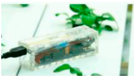
Fig. 3. Sensor for greenhouse or hydroponic crops.

This open-source system includes a set of sensors recording numerous data: luminosity, air and soil humidity, water temperature, PH... as shown in Fig. 3. below, which are processed on cloud servers. A remote monitoring and an SMS alert system allow to manage the greenhouse and to decide on possible corrective actions.