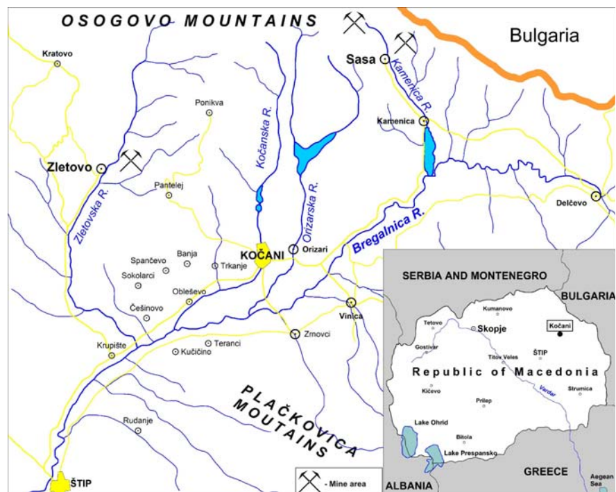
Fig. 1 Map of the study area showing the drainage system of the Bregalnica River and its tributaries

Kočani Field, well known for its paddy fields and thermal waters, is located in the eastern part of Macedonia, about 115 km from the capital city, Skopje. It is situated in the valley of the Bregalnica River, between the Osogovo Mountains in the north, and the Plačkovica Mountains in the south (Fig. 1). Its average length is 35 km and its width is about 5 km. The paddy soil of Kočani Field was estimated to originate from the composite material of the sediment derived from igneous, metamorphic and sedimentary rocks transported by the Bregalnica River and its tributaries and deposited in the Kočani Depression (Dolenec et al. 2007).