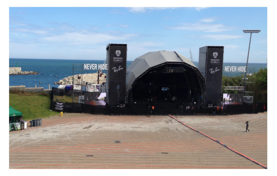
Fig. 1. The sponsor-oriented names of festival stages.

As Beth illustrates, the industrial character of Primavera's setting makes it difficult to relax (Fig. 2); this prevents the development of customary in-festival routines and overtly links Primavera with the