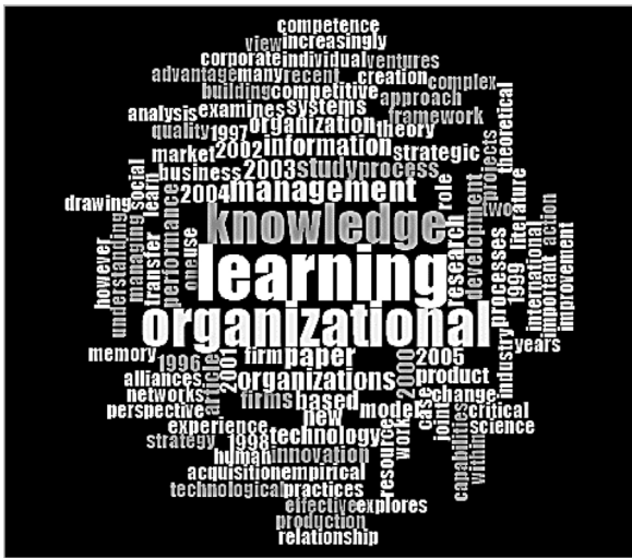
Fig. 3. 100 exactly most repeated words.