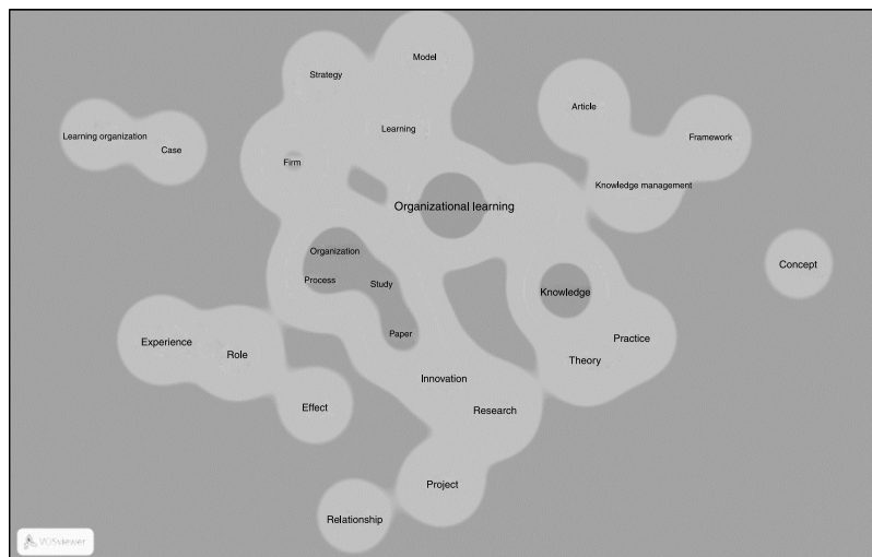
Fig. 2. Visualization of the density of each item.

Research on organizational learning has been under development since the 1960s while this study conveys the expansion in this field of study especially since 2009.