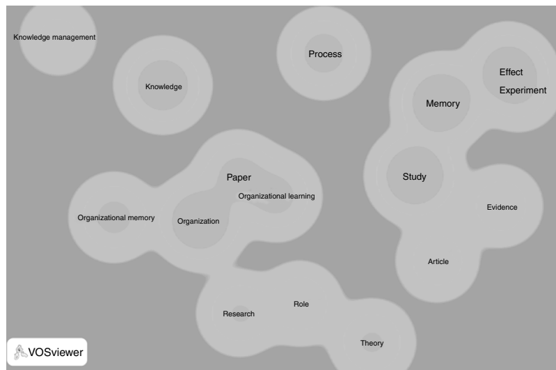
Fig. 5. Visualization of the density of each item.

The most repeated and used terms and words in the first study were aggregated into five clusters of association, with the terms “organizational learning” and “knowledge” displaying the greatest density or the highest exact repetition of words. Following the terms “organization”, “knowledge management”, “process”,