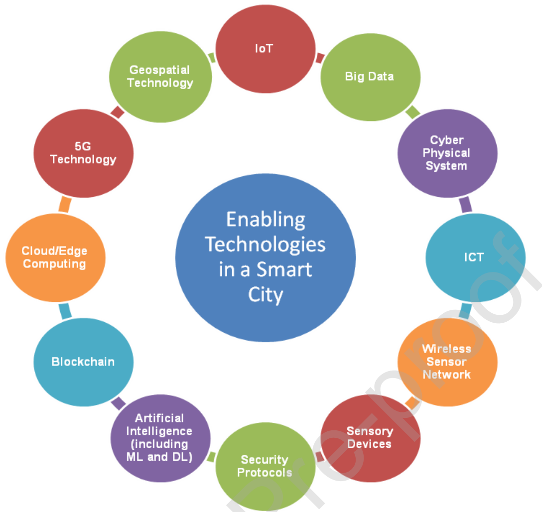
Fig.2. Enabling Technologies in Smart City

Providing seamless connectivity within all the participating entities of a smart city is pivotal to any smart city project. The use of cloud/Edge computing paradigm and ICT along with dynamically changing network configurations management with the help of software defined networking (SDN) can aid in providing a seamless connected network which is self reliant and always on [42-43]. The data processing, management and analysis can be handled by big data management software like Hadoop, Cassandra, Quantcast etc [41-42]. All such software has their advantages and limitations. Some are appropriate for real time processing while the others are suitable for performing historical data analytics. The devices in a smart city are embedded with sensors which are self sustainable and automated. The integration of physical devices,