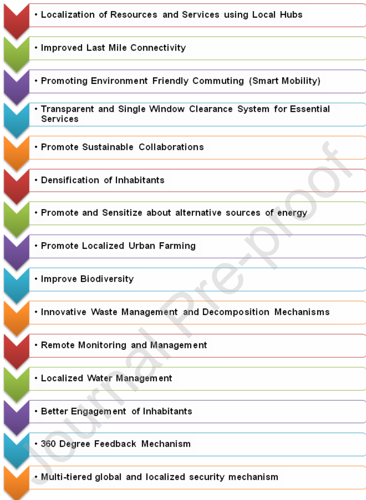
Fig.5. Roadmap for Sustainable Smart Cities