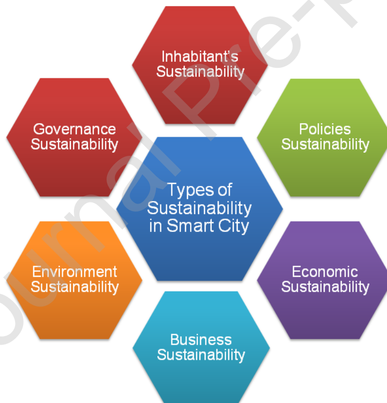
Fig.4. Types of Sustainability in a Smart City

an urgent need for devising the mechanisms so that the consumption of resources (natural and man-made) must be administered and monitored keeping in view the future generations. The United Nation's SDGs also point in the direction of achieving sustainability in every aspect of life. Another important factor which is to be considered while designing the smart city ecosystem is the optimal management of waste generated through computing or other developments (including e-waste). The underlying infrastructure of the smart city must be able to interface with the strong and dynamically evolving prediction algorithms so that the future needs and expenses are estimated well before time and preventive measures can be taken if the need arises. This predictive analysis is highly crucial for the successful implementation of the smart city ecosystem [65-66]. There exist several types of sustainability in a typical smart city ecosystem as shown in figure 4.