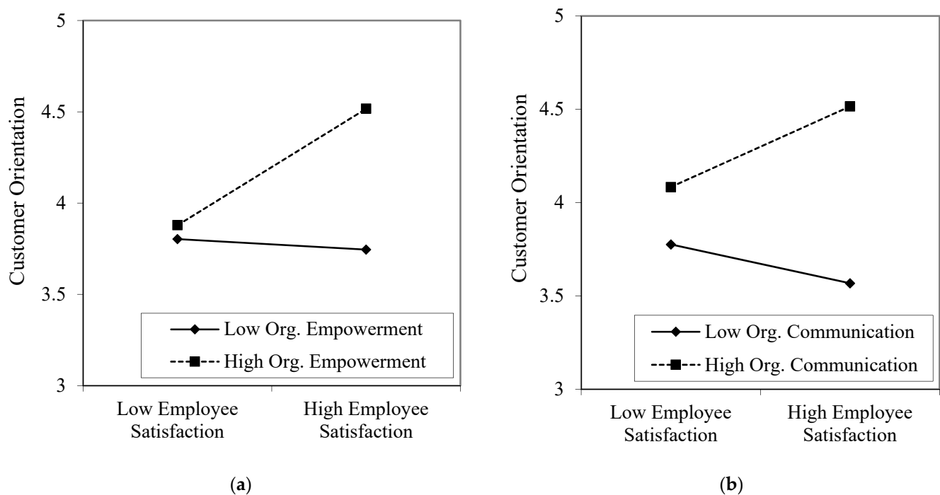
Figure 2. Moderating effects of (a) organizational empowerment and (b) organizational communication in the relationship between employee satisfaction and customer orientation.