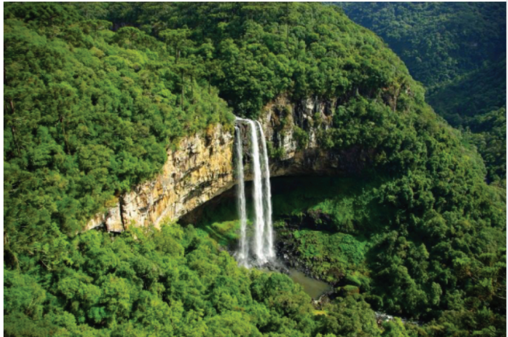
Figure 2. Ashare waterfall, Sources: South Achefer Woreda Government Communication Affairs Office, 2014.

which could have major tourism potential. Some of the common wetland bird species for bird watching and viewing practices were Cormorant ( Phalacrocorax carbo ), and Egret ( Mesophoyx intermedia ), Sacred Ibis ( Threskiornis aethiopicus ), Fulvous Whistling-Duck ( Dendrocygna bicolor ) Open-billed Stork ( Anastomus lamelligerus ) and Common Crane ( Grus grus ), Wattled Crane ( Grus carunculatus ). This potential is also supported by the key informants. The study area is endowed with many types of bird species to attract bird watchers, mountains for mountain climbing/trekking and varied wildlife for wildlife viewing activities (Aseres, 2015).