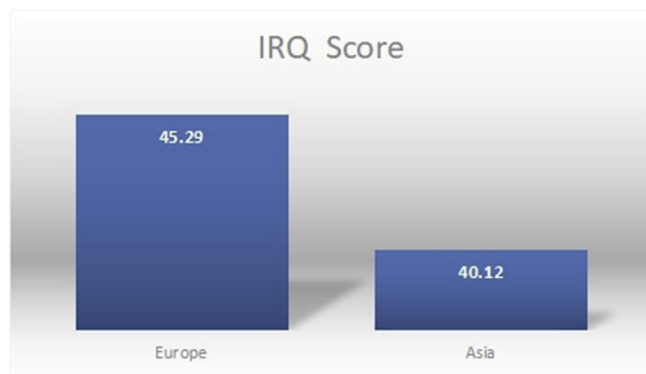
Figure 1. IRQ score in 2016.

Spread is computed by a quarter average of the ratio of daily closing bid-ask spread to the closing price for firm i in the quarter t in the year 2017 multiplied by 100. IRQ is assessed by content analysis. Size is the logarithm of total asset. Growth is the market to book ratio. Profitability is measured by Return on Asset (ROA). LNPrice is logarithm of the adjusted price. Revenue is the net revenue divided by total assets. Industry: 1:OCF is the net operating cash flow divided by total assets. Industry, 1: manufacturing industry, 2: mining, 3: utilities and services, 4: construction/real estate, 5: other. Region is dummy variable: 1 = European firms, 0 = Asian firms.