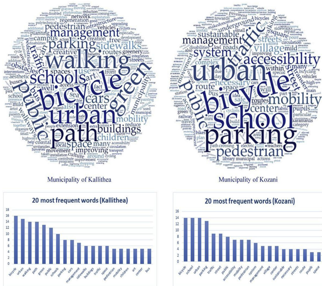
Fig. 4. Word cloud analysis, based on the ideas proposed by the citizens of Kallithea and Kozani through web-platforms. word cloud analysis logo.